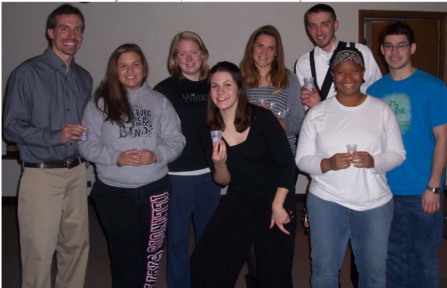
Judsonites posing after our last service of 2011

Note: in case it wasn't clear from the context, this newsletter was written by Phil unless otherwise indicated.